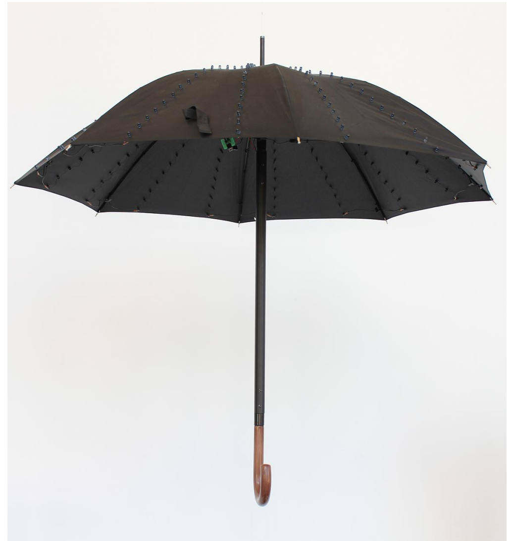
Mark Shepard, CCD-Me-Not-Umbrella , Sentient City Survival Kit (2010).

Kang's message is clear: core human values can be threatened by the migration of activities and practices to “cyberspace,” or in contemporary parlance, by digitally mediated activities and practices. The answer is not a retreat from new technologies, but a recognition of what is at stake and a move to compensate for unacceptable changes (losses)